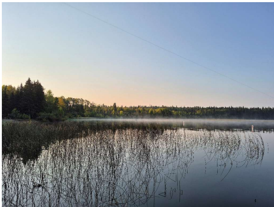
Morning Mist on Carson Lake