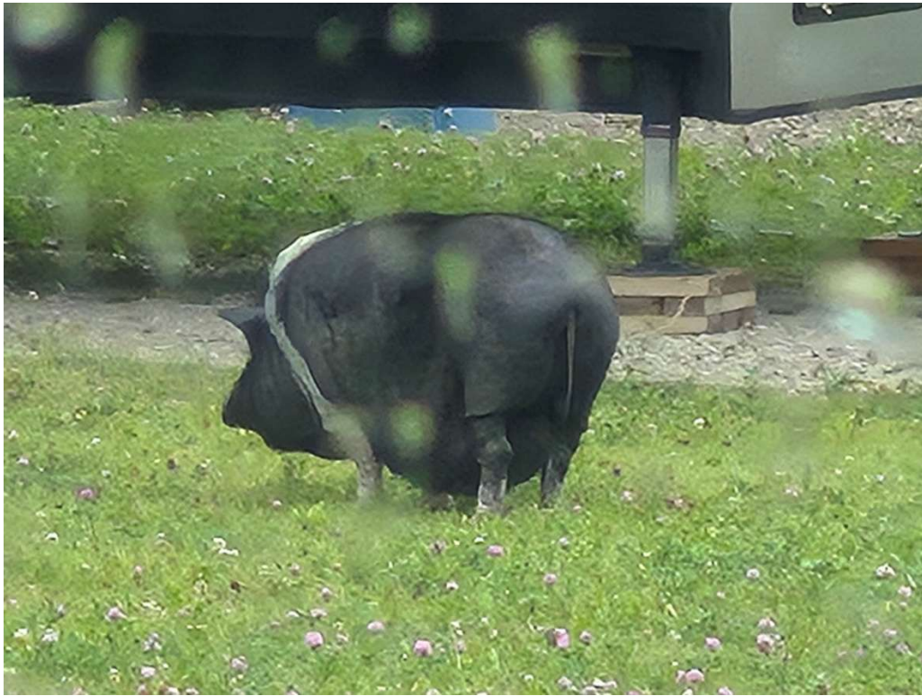
Vietnamese Pot-Bellied Pig

Once we got settled into our site it was still raining on and off so we decided to just stay in with no fire tonight. I am still getting used to the two new meds I am taking and, combined with the meds for my restless leg symptoms which were very active, I went to bed about 9:00. I intended to read but never got the chance passing out as soon as I got horizontal.