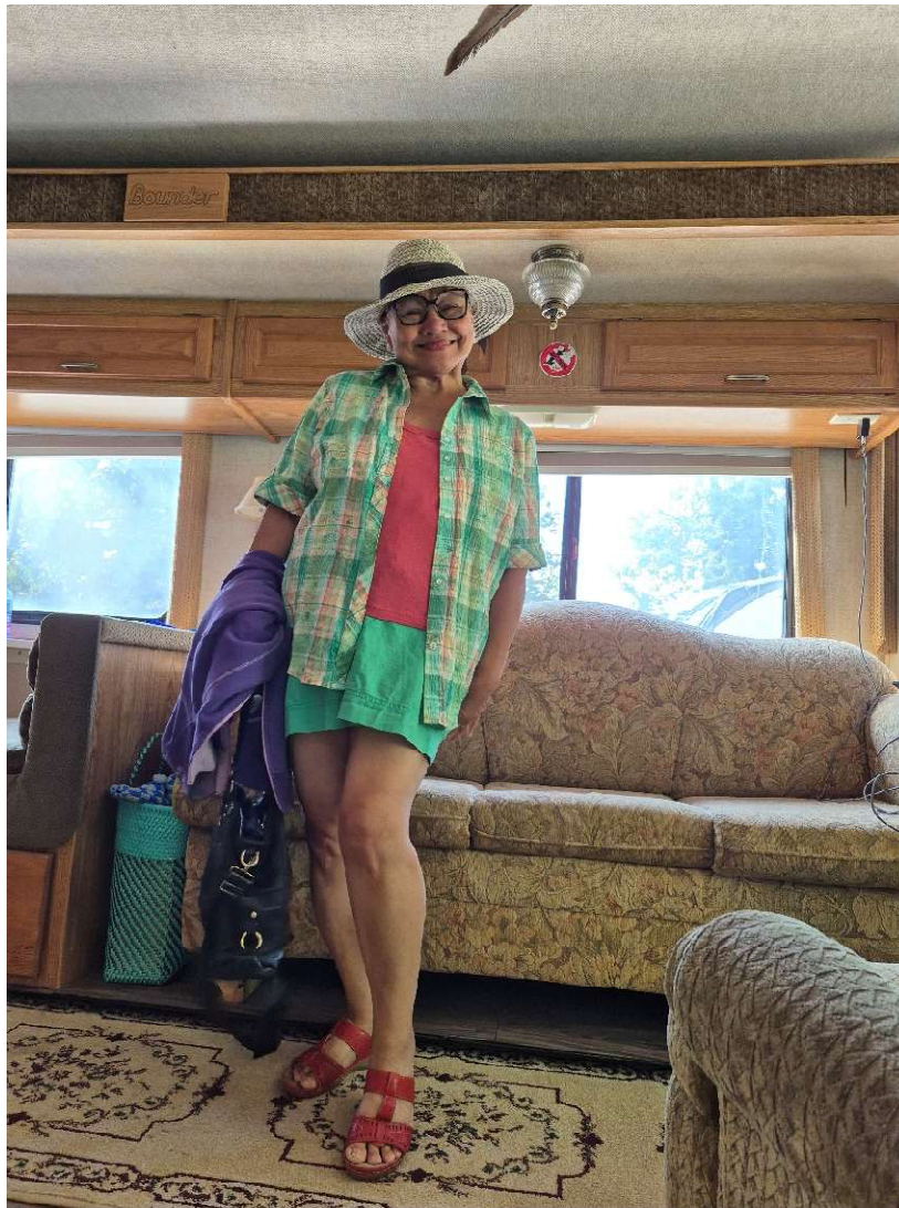
Tess Ready to go to Town

We woke Thursday up to another beautiful, sunny end-of-summer day. Each day the trees are turning more yellow. Nights are down to mid-single figure temps and the days are perfect with a gentle breeze. There are no mosquitos so it doesn't get much better than this. The bears seem to have left the area but we will keep a tidy camp so they don't have reason to return.