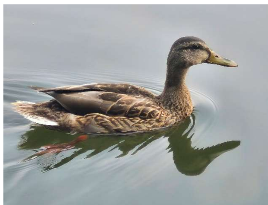
Female Mallard Duck