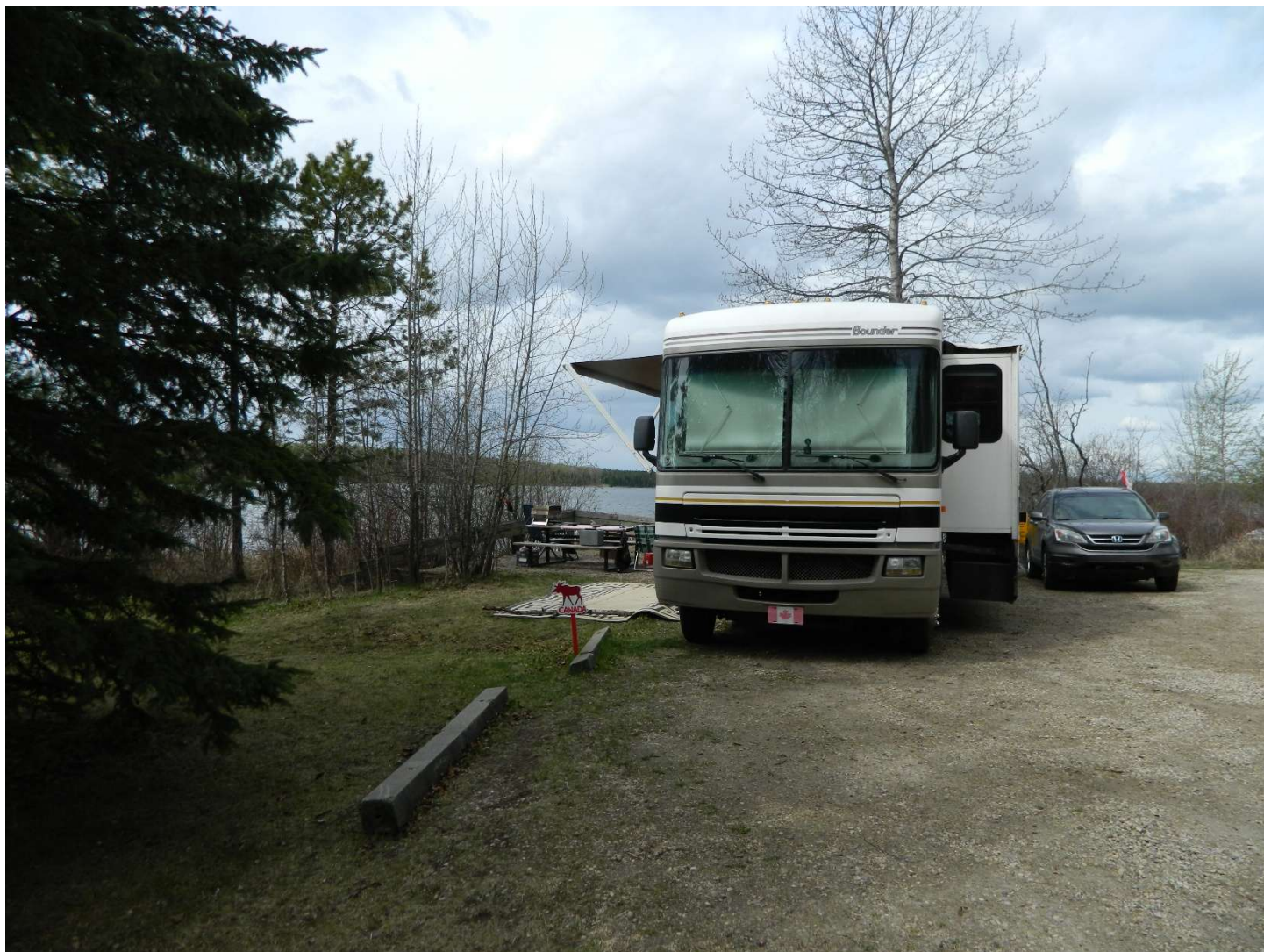
Carson-Pegasus Prov Park Site H175

The drive out to the campground was uneventful. The trees are budding out and the fields are turning green near Edmonton but an hour NE on Hwy43 everything still looks dormant and brown. I expect things may green up here in the coming days.