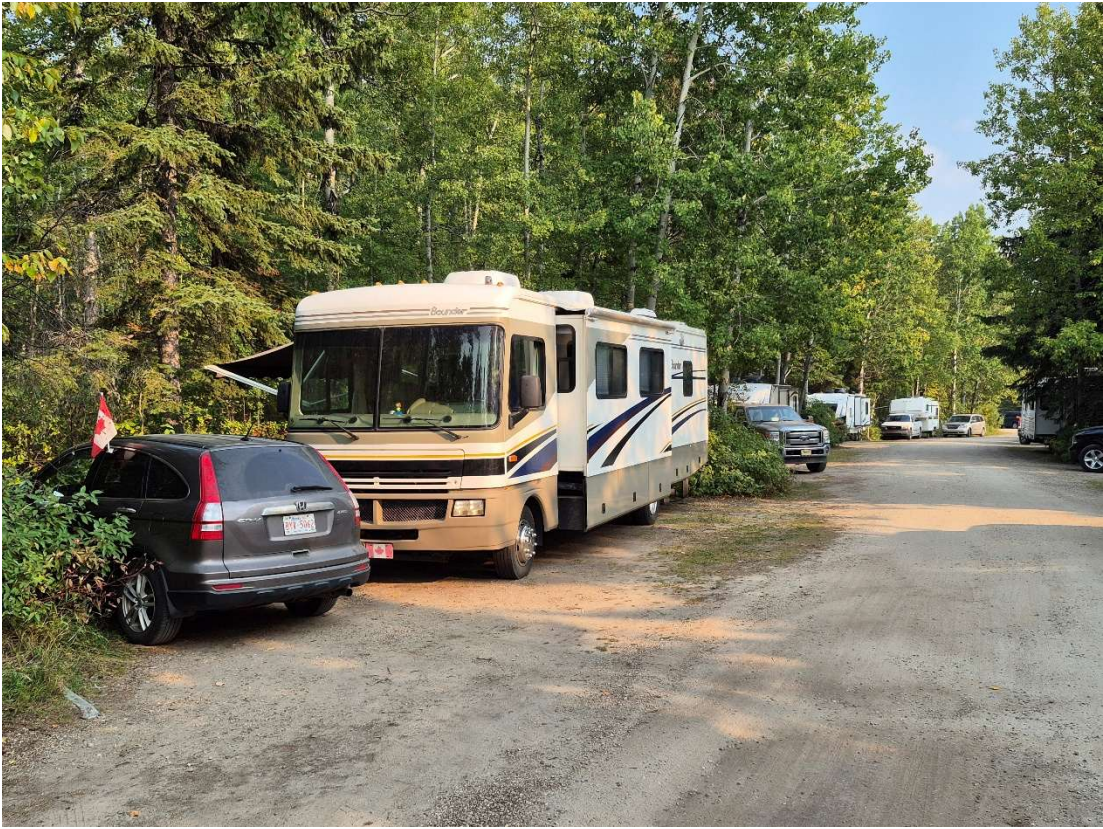
Carson-Pegasus Site H179