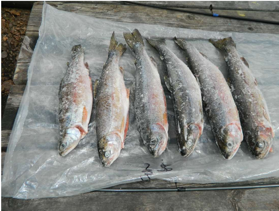
Our Catch for the Week