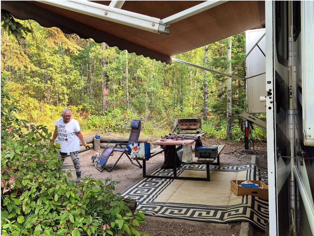
Carson-Pegasus Site H179