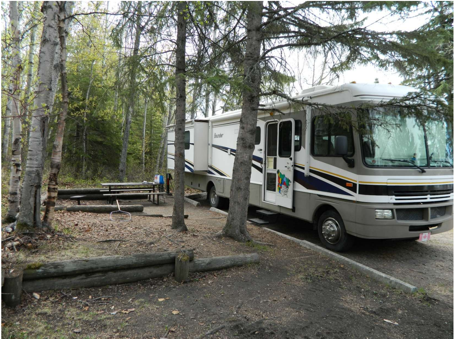
Carson-Pegasus Prov Park Site H178

Today is moving day. It is a lot of work just to move across the street! I put away all the outside stuff yesterday so it was just organizing the inside stuff today. We finished up by 11:00, which is checkout time.